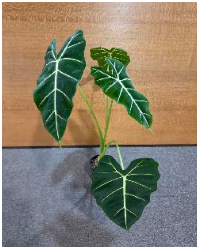
Alocasia Green Velvet