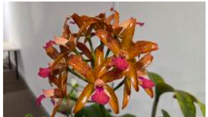
Cattlianthe Fantasía Jíbara