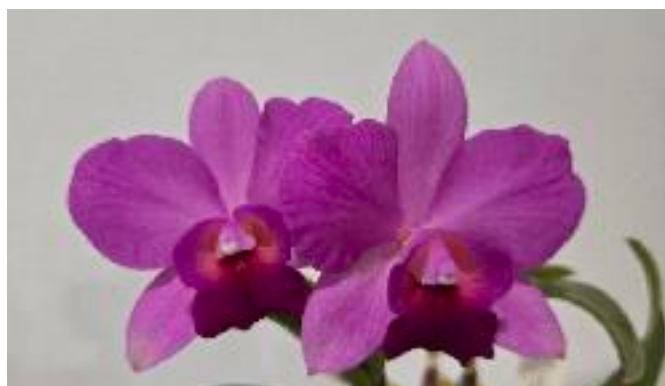
Cattleya Minyama Magic- growing competition