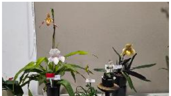
Paphiopedilums and Phragmipediums