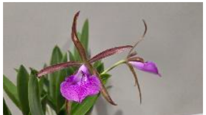
Brassocattleya Star Ruby 'Xanadu'