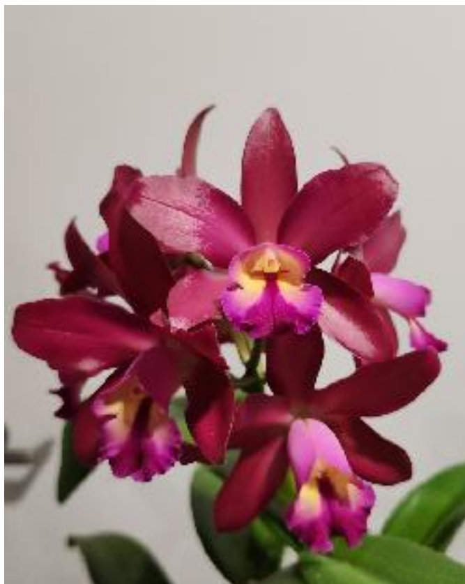
Cattlianthe Gérard Nappert 'Southern Cross'