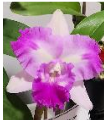
Rlc. Burdekin Charm