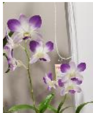
Dendrobium Aridang Blue