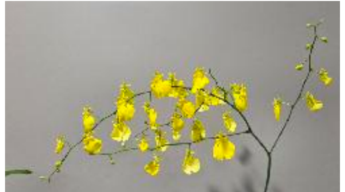
Oncidesa Sweet Sugar 'Lemon Drop'