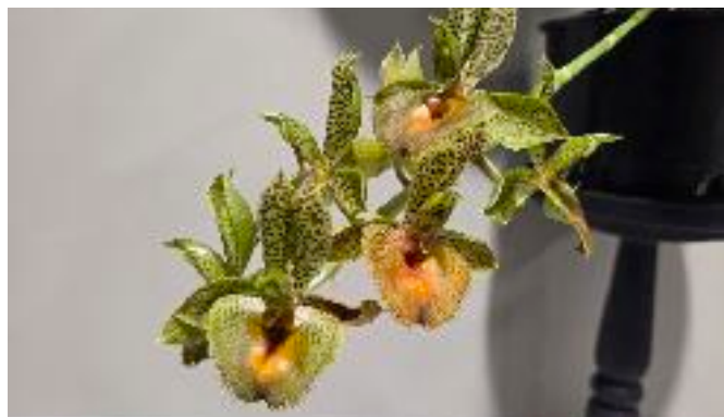
Clowesetum Amazing Grace