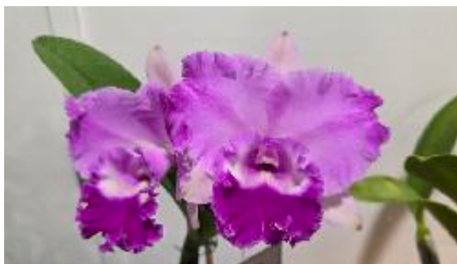
Rhyncholaeliocattleya Burdekin Charmv 'Angela'