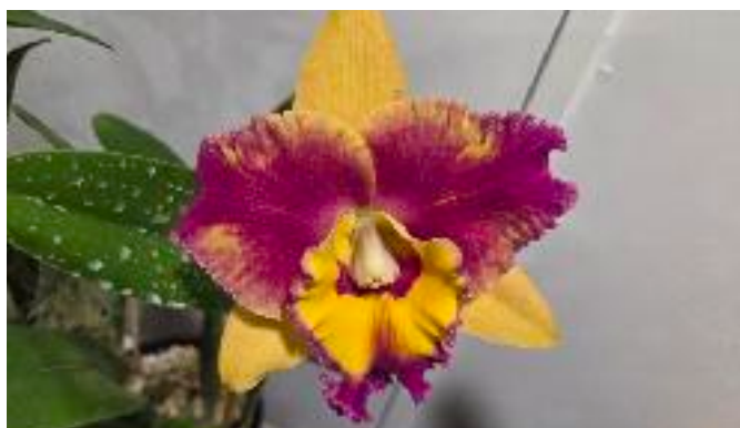
Rhyncholaeliocattleya Rungnapha Fancy 'Warm Welcome'