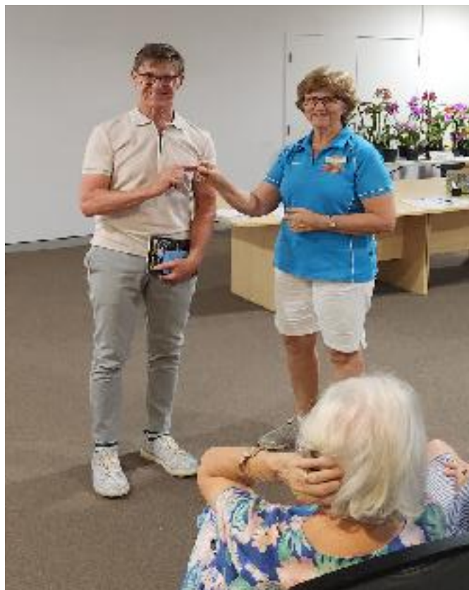
Welcoming a new member to the fold