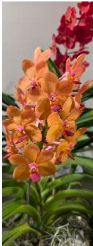
Vanda Kultana Gems