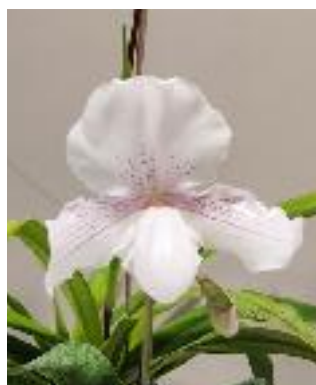
Paph. Nathaniel's Kunzite