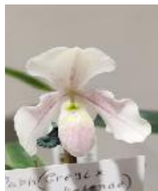
Paphiopedilum Lara Croft