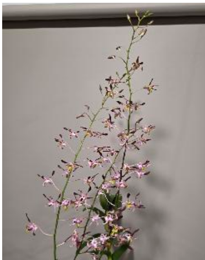
Dendrobium Magenta's Carroline