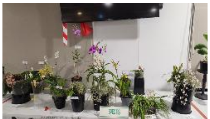
The Species lineup for the night