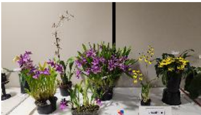
The Oncidium Alliance