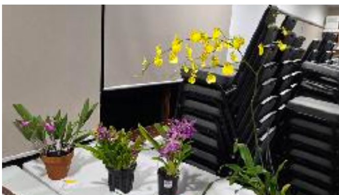
The Novice bench