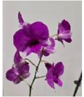
Dendrobium Santi Fancy