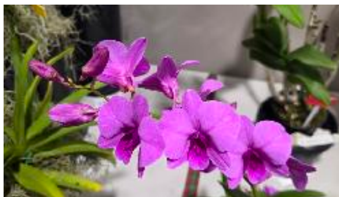
Dendrobium Enobi Purple