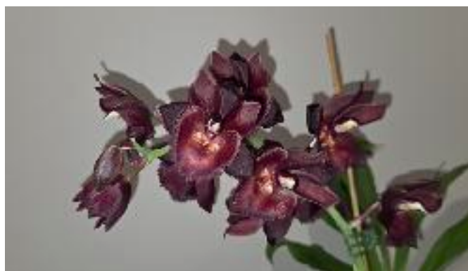
Catasetum Chocolate Cherry Fudge