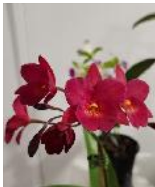
Guaritonia Why Not