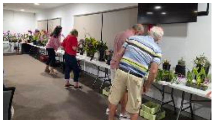
Picking the night's winners