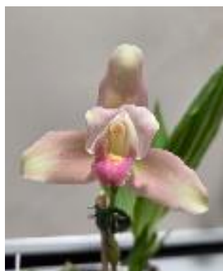
Lycaste Kelvin Grove