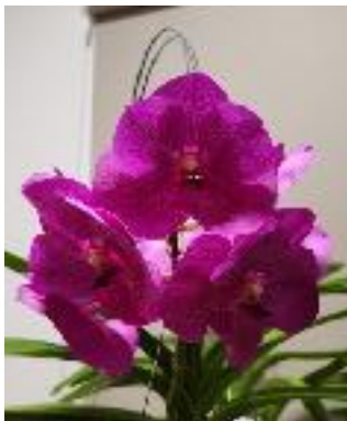
Vanda Brighton's Ruby Jewel