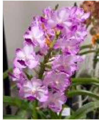
Vandachostylis Janice Allison