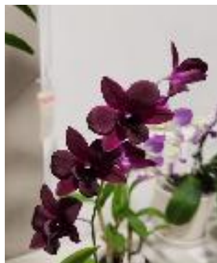
D. Sakada Red x Alstonville Inferno