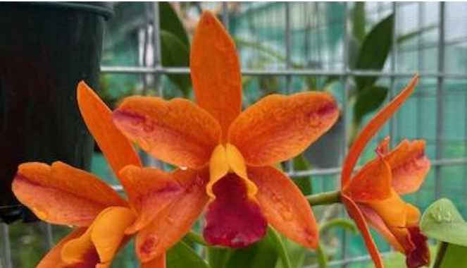
Cattlianthe Varut Startrack