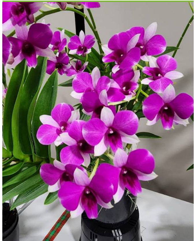
Dendrobium Seree x Triangel