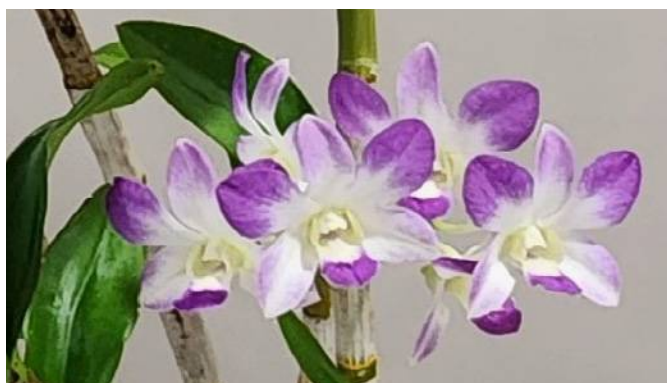
Dendrobium Aridang Blue