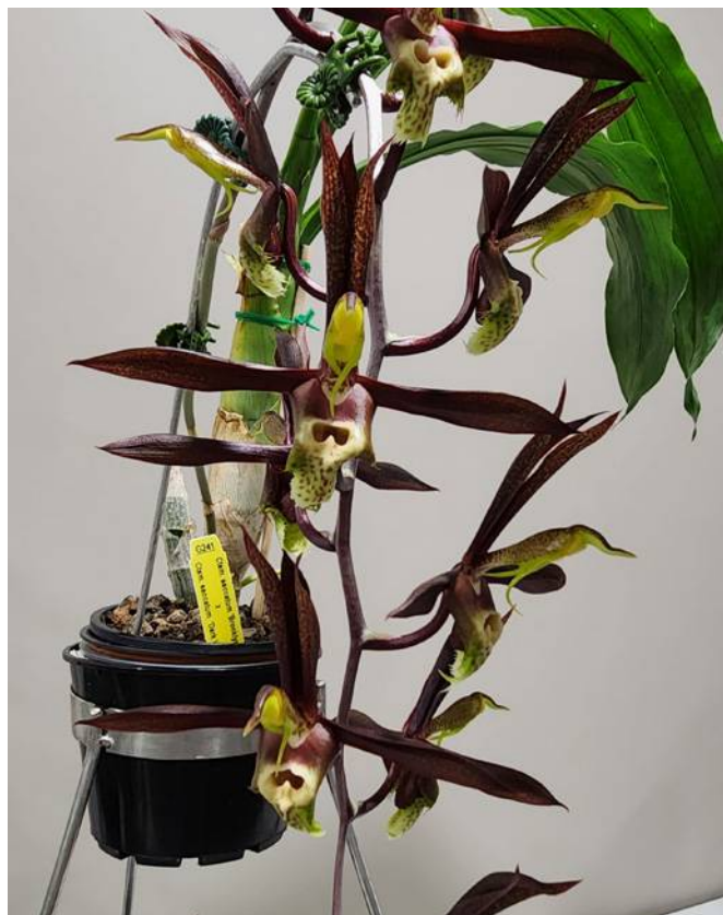
Lots going on in these wierdly wonderful flowers