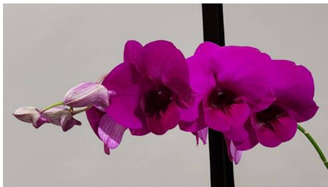
Dendrobium Dal's Jewel x Patricia Ward