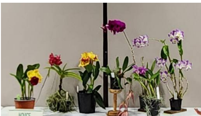
Some fine plants from the novices tonight