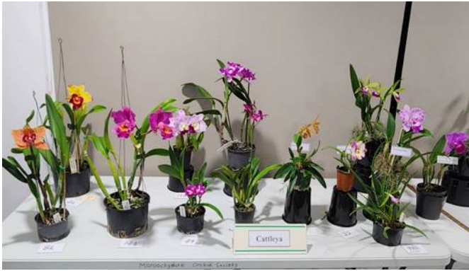
The Cattleya alliance