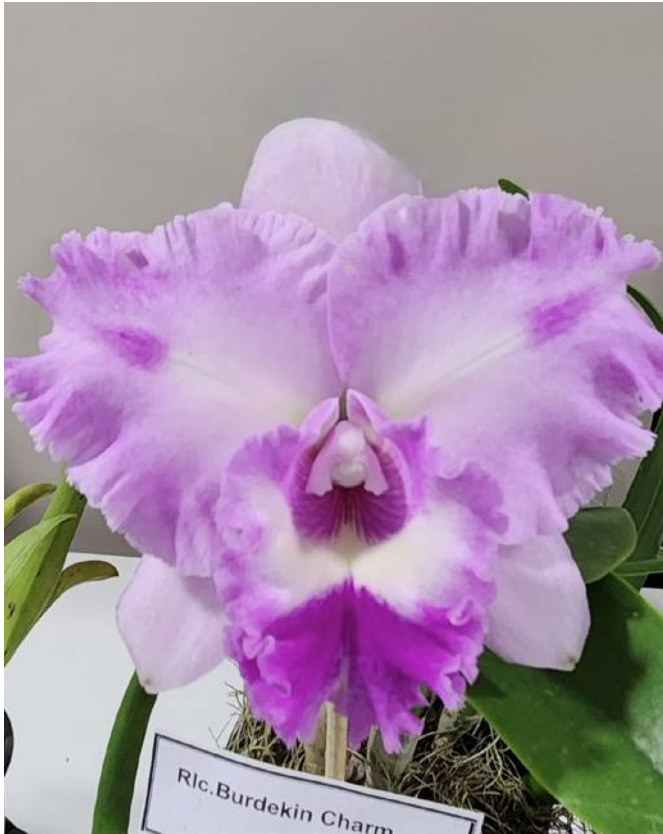
Rhyncholaeliocattleya Burdekin Charm