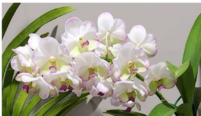
Aeridovanda Luang Prabang