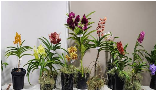
Lots of colours on the Vanda bench