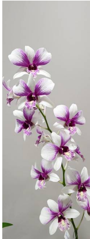
Dendrobium Pop Eye