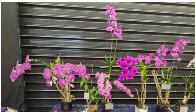
The bigibbums certainly turned it on