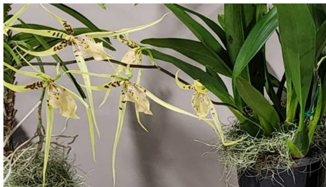
Bratonia Penny Micklow