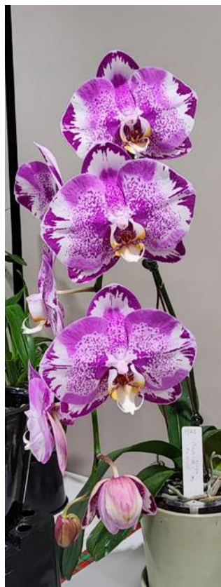
Phalaenopsis Fuller's 3545