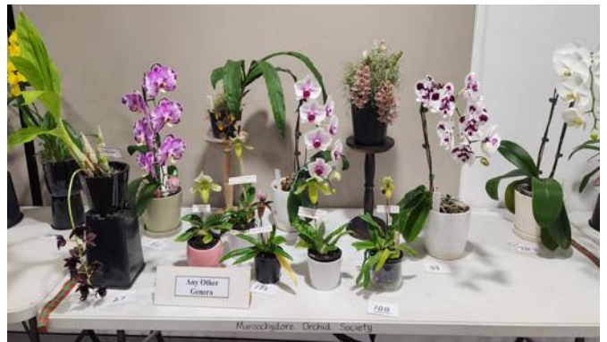
Some beautifully presented Phals among all the other genera