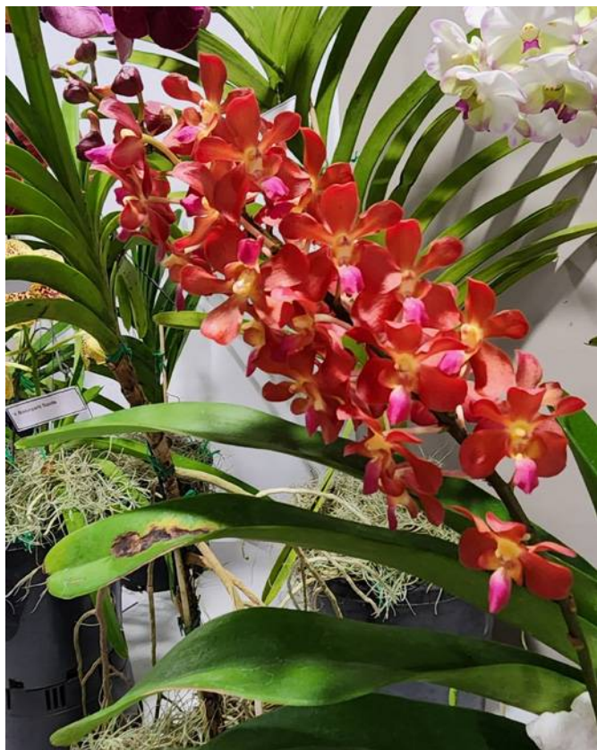
Waironara Tango Fire