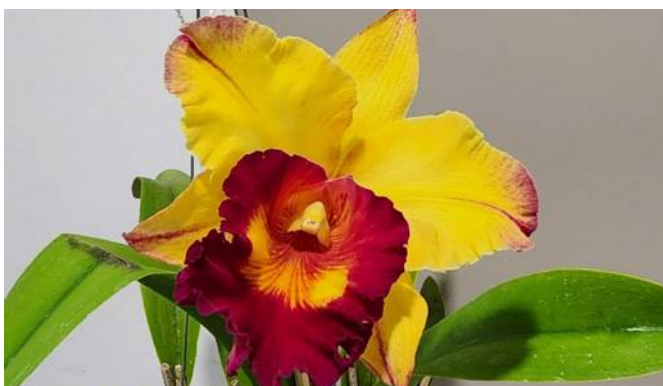
Rhyncholaeliocattleya Liu's Joyance