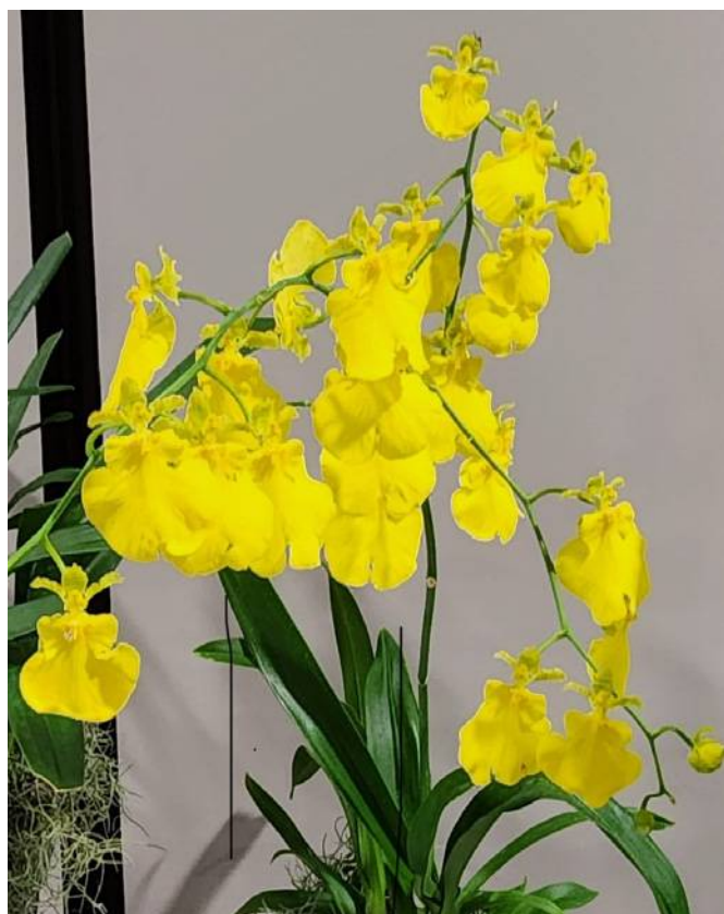
Oncidesa Sweet Sugar