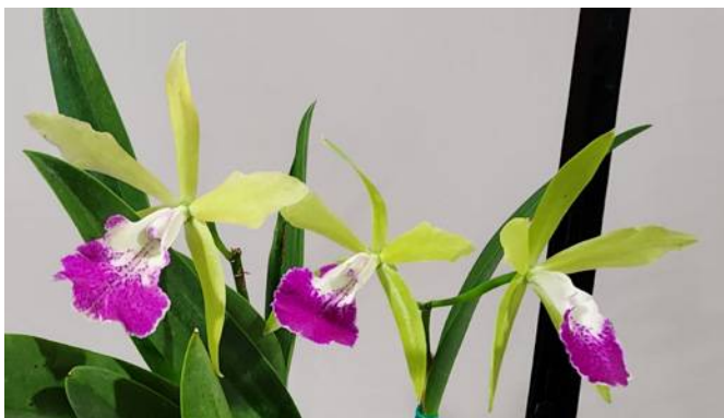
Rhyncattleanthe Sunny Sword