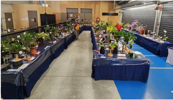
There was a lot to see at EDOS