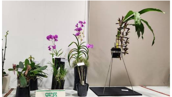
Our Species bench