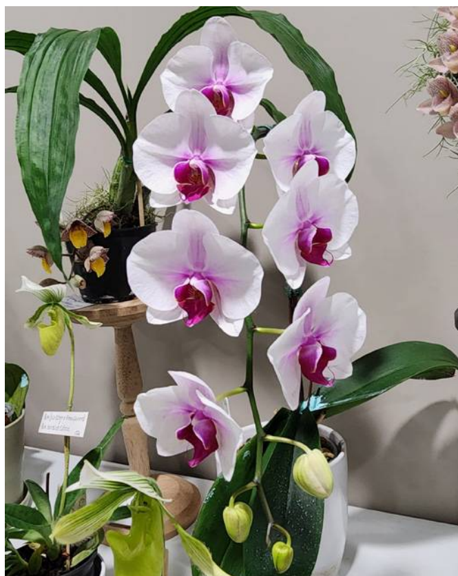
Phalaenopsis Mount Lip