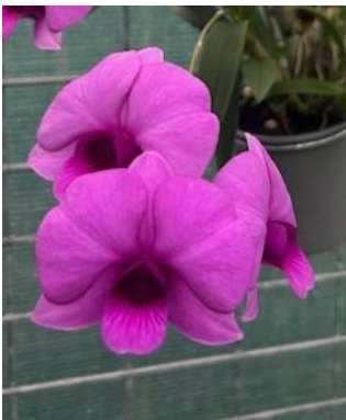
A lovely Brassavola novelty