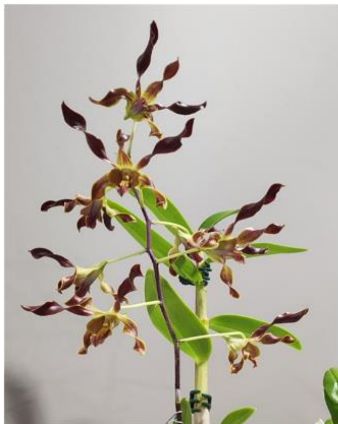
Dendrobium Rosalind Quek Choon Lin x (Charelle x Brown Pixie)