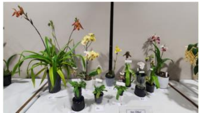
All the other Hybrid Genera