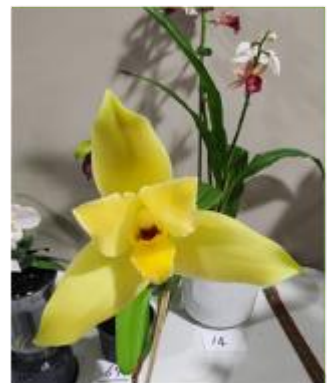
Lycaste intergeneric hybrid