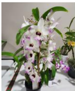
D. Love Memory 'Fizz'