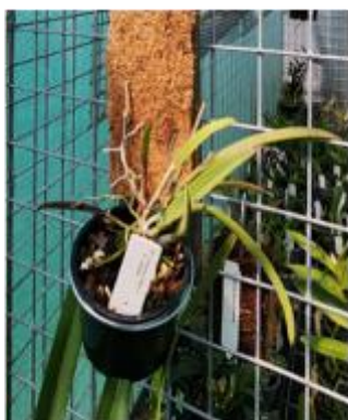
Some innovative solutions to orchid growing problems