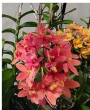
Epidendrum Wedding Wine