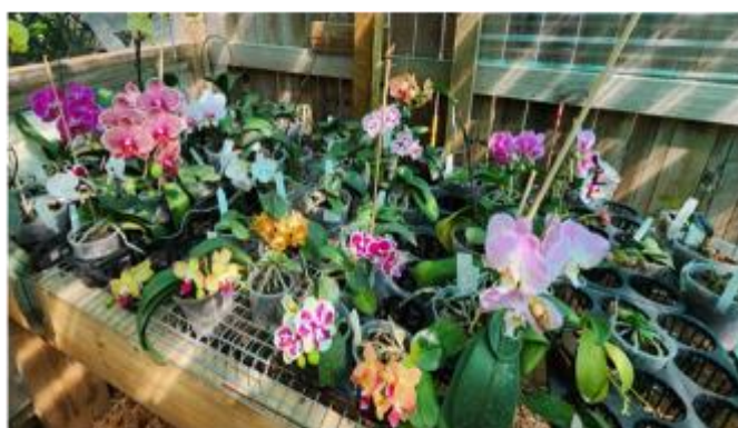
His Phallies are always fabulous