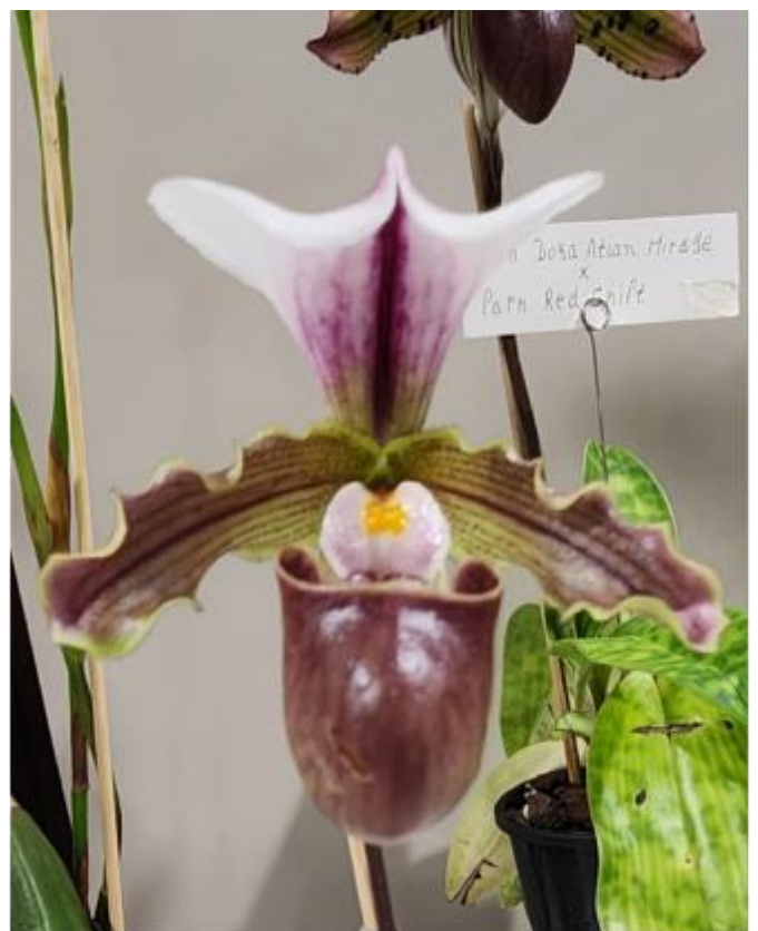
Paphiopedilum Haur Jih Lovers