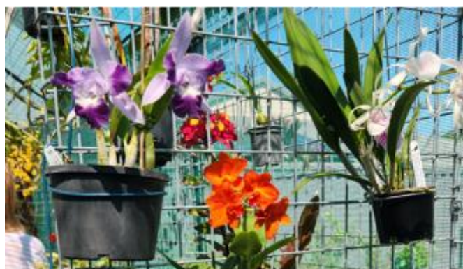
...and there were plenty of other orchids in flower