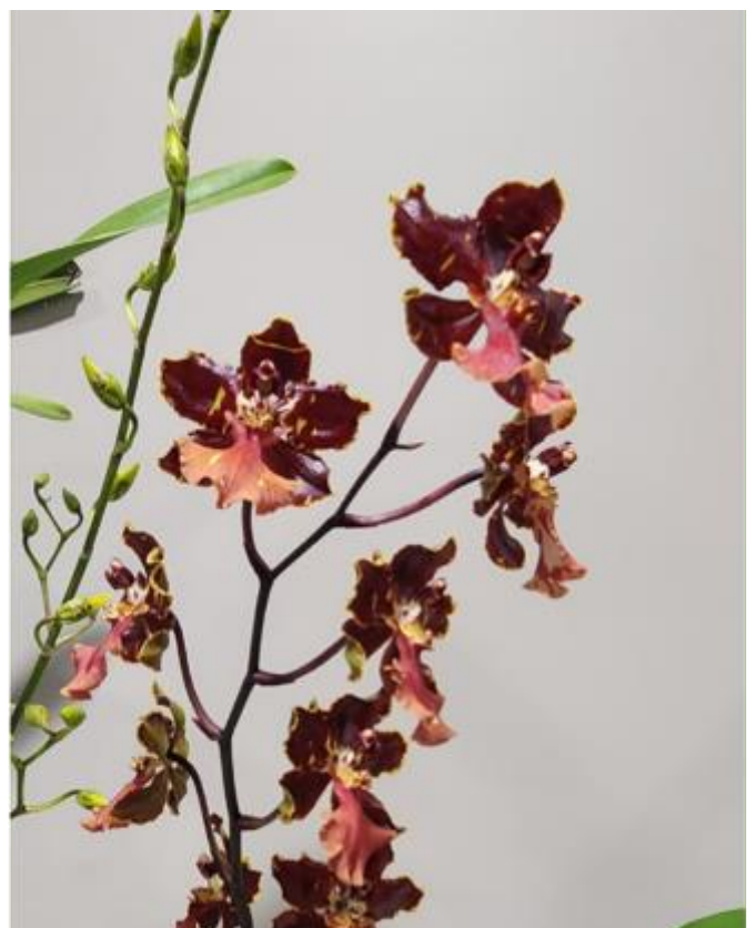
Otorhynchocidium Cherry Fudge