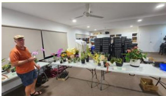
Gerry owned the Novice bench tonight