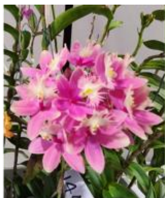
Epidendrum Wedding Wine