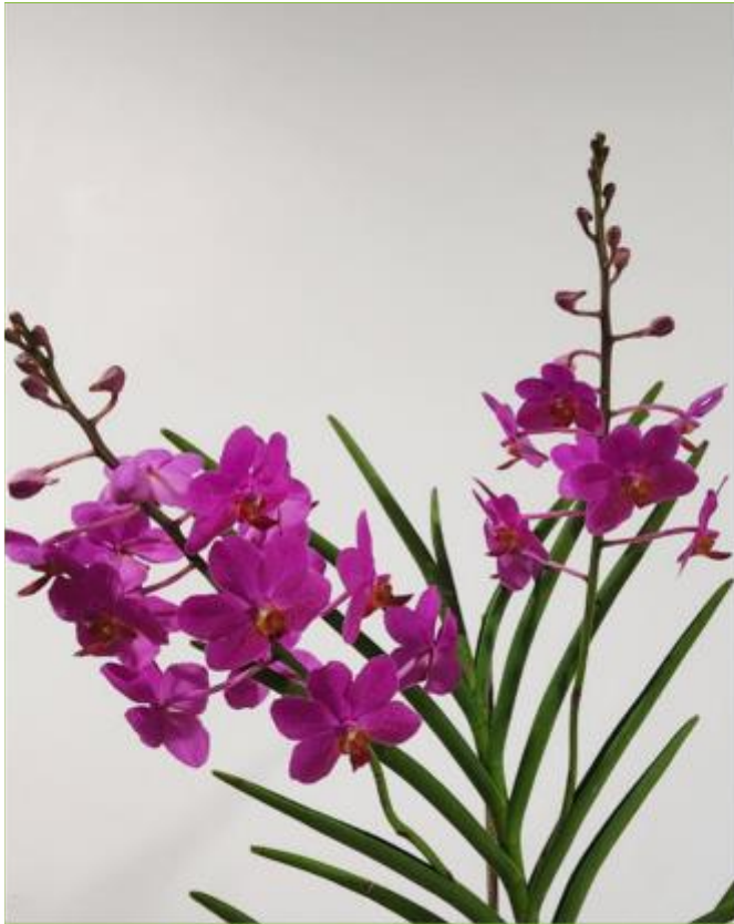
Papilionanda Carolyn Warne