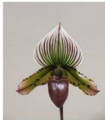
Paphiopedilum Red Mirage