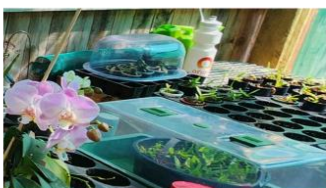
Orchids go to preschool too