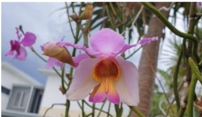
Papilionanthe Miss van Deun