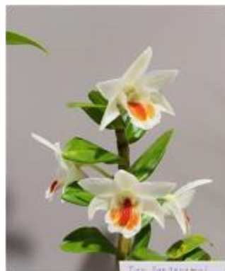
Dendrobium Jairak Dawn