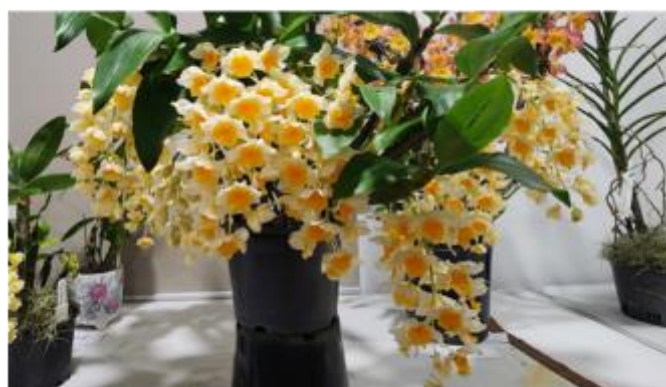
Dendrobium Chet's Choice