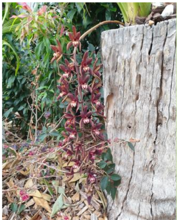
Cymbidium Australian Midnight 'Black Beauty'

NOVEMBER Ian W, Joe M DECEMBER EVERYONE TO BRING A PLATE