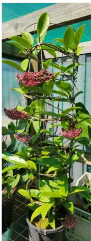
A well grown Hoya hybrid