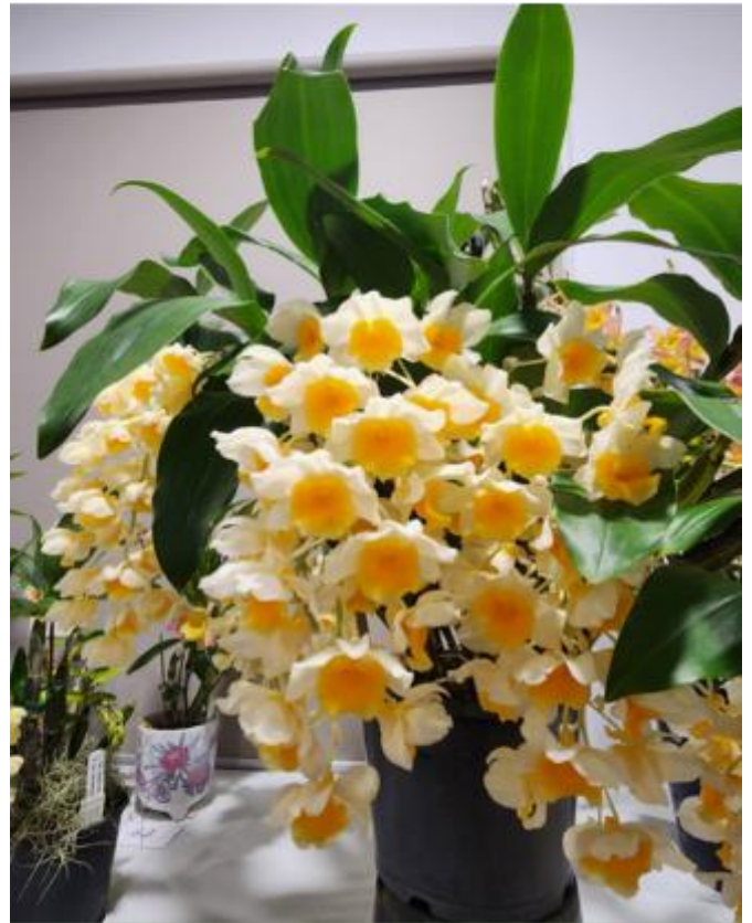
Dendrobium Chet's Choice