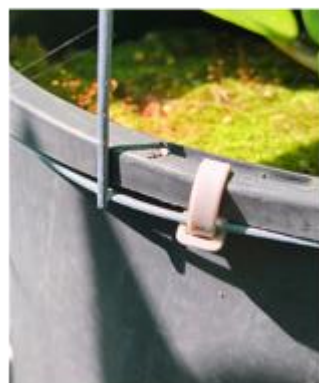
Zip ties to secure frame to pot