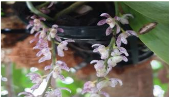
Peristerchilus Olive Grace