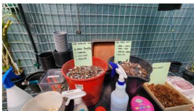
A tidy propagation station