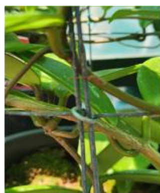
Fencing clips to make frames