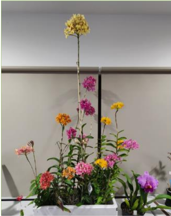
A reedstem posy bursting with colour