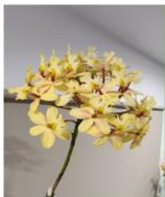
A super tall reed stem Epi