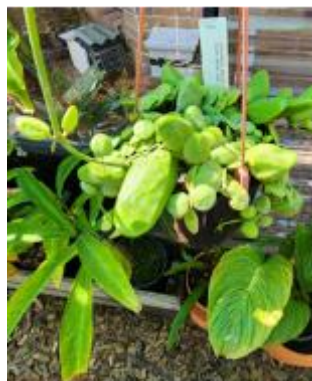
There were plenty of other sub-tropical curiosities to look at