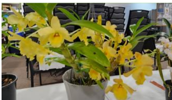
A pretty yellow softcane Dendrobium