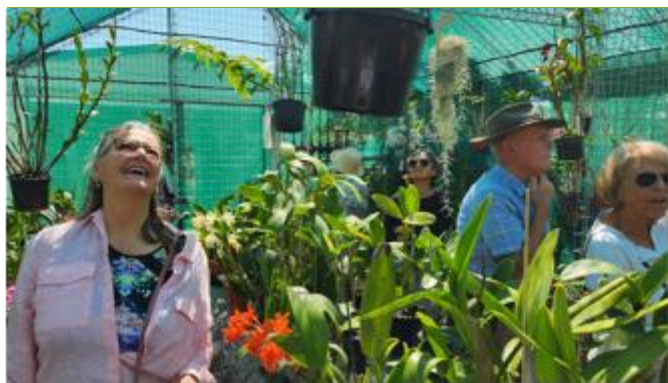
There were lots of wonderful orchids to see