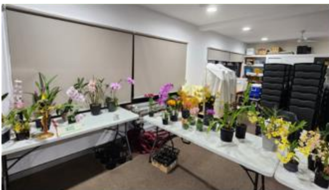
Two bays for the Novices tonight