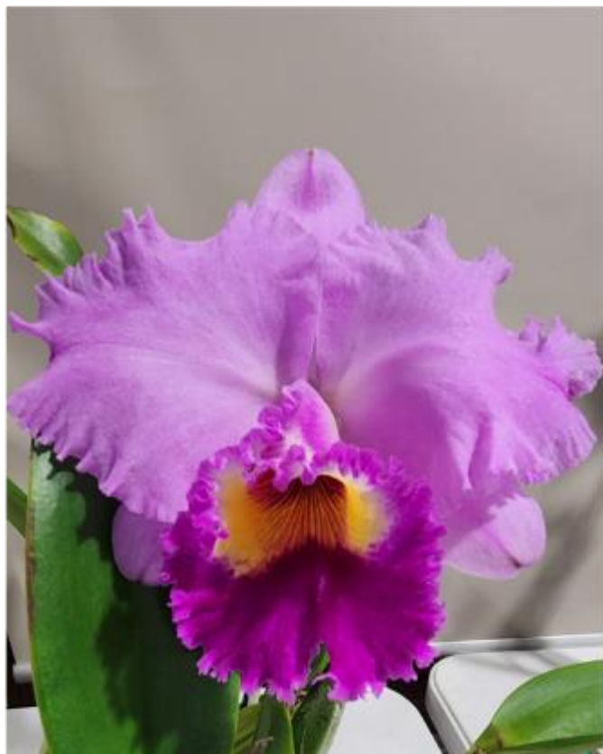
Rhyncholaeliocattleya Burdekin Dream