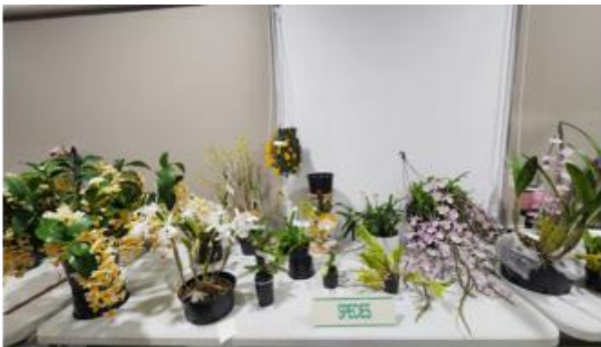
A diverse Species section