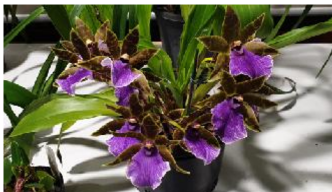
Zygopetalum Kiwi x Mishima Goddess