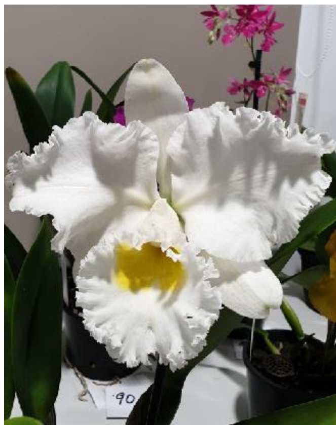
Rhyncholaeliocattleya Burdekin Bells 'John'