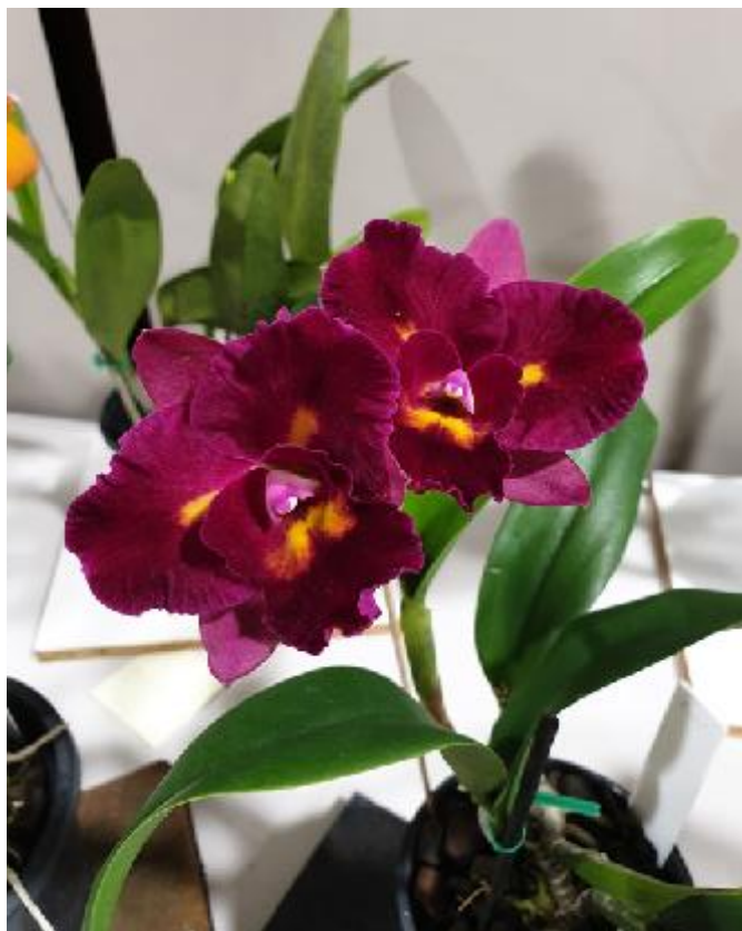
Rhyncholaeliocattleya Rosella's Victory 'Sensational'