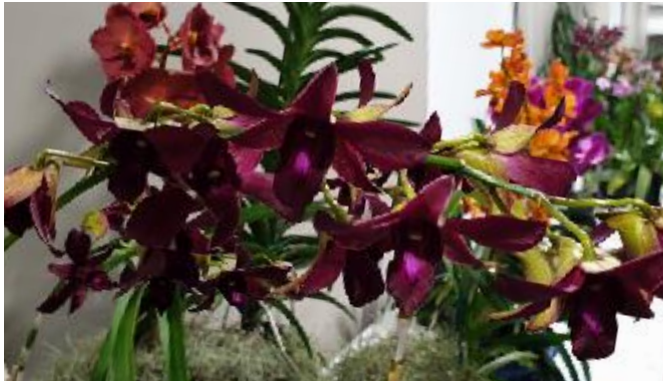
Dendrobium Captain Junior