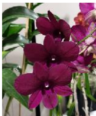
Another striking Dendrobium