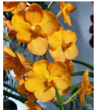
Another pretty Vanda