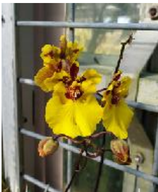
Oncidiums well represented in Dougie's collection