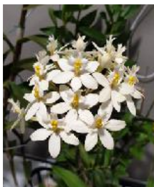
A lovely Epidendrum