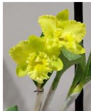
Rlc. Karen's Sunrise