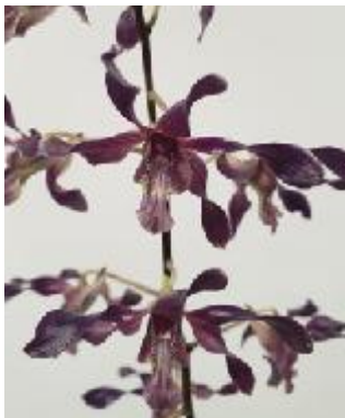
Dendrobium Speewah Pride