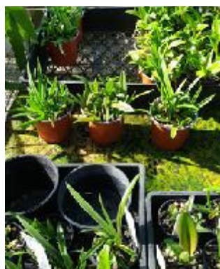
A constant flow of seedlings