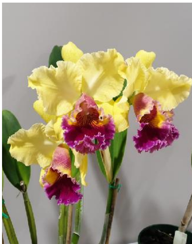
Rhyncholaeliocattleya Home Hill 'Sunshine'