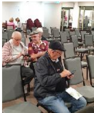
Constantly researching orchids