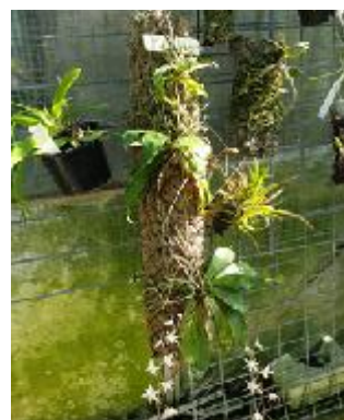
Innovative growing solutions