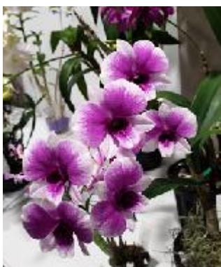
Dendrobium Santi Fancy