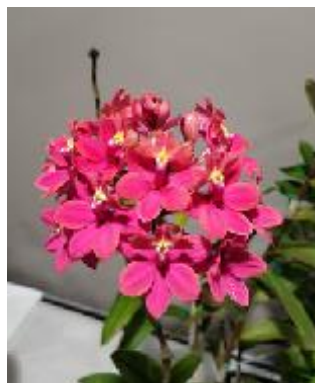
Epi Marine Valley x Pacific Mulberry