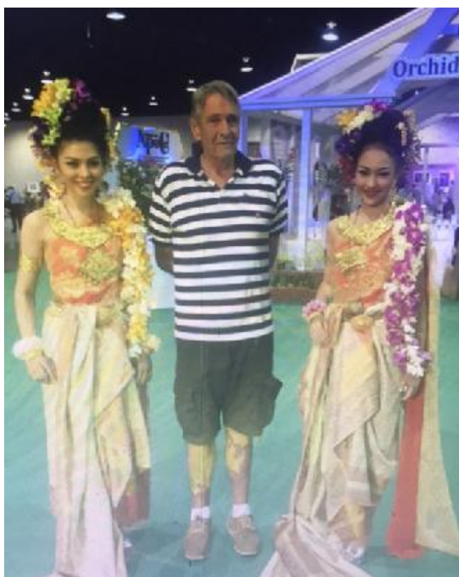
The theme of the conference was "Orchids and Human Beings"