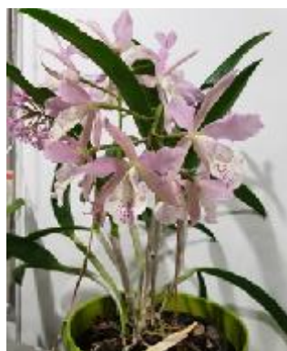
Bc. Sadies Special