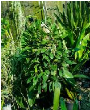
It takes a lifetime to grow some of these specimens