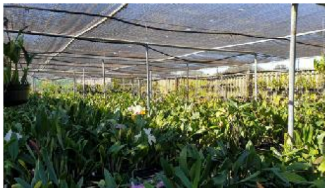
A sea of orchids to roam about in