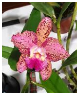
A colourful bifoliate Cattleya