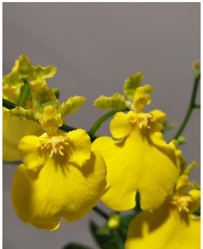
Oncidesa Sweet Sugar 'Lemon Drop'