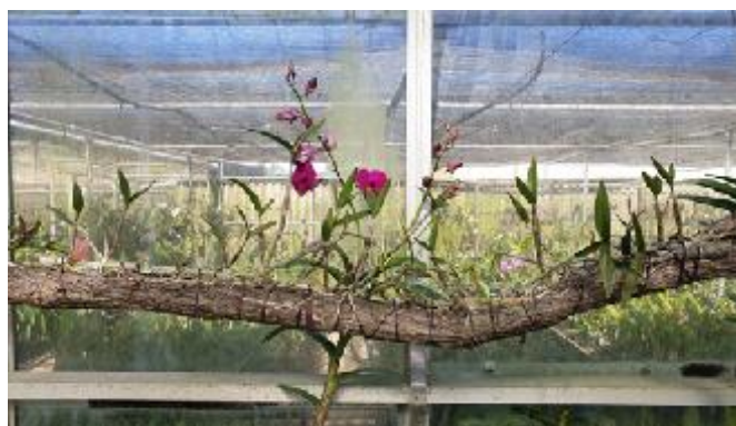
Another innovative growing solution