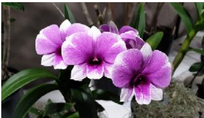
Dendrobium Yaya Compact