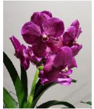
Vanda Doctor Anek