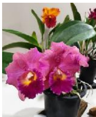
Rlc. Flame Delight 'Margaret K'