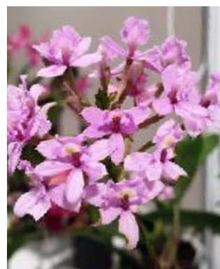
Another lovely Epidendrum