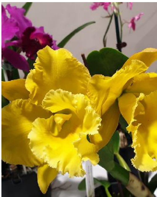
Rhyncholaeliocattleya Thaksina Gold