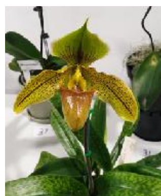
Paphiopedilum Iluka Queen