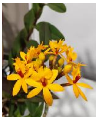
A cute little Epidendrum