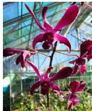
An intermediate Den hybrid