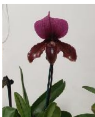
Paph. Hsinying Market x charlesworthii