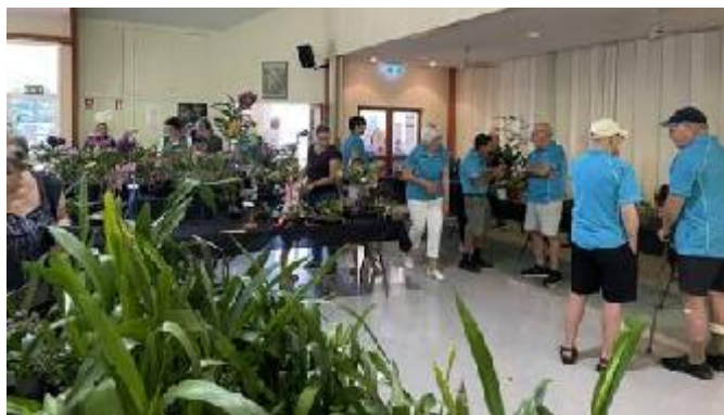
And the show is up and running