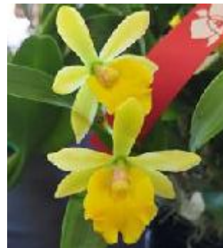
Sergioara Yokosuka Story 'Little Oriole'