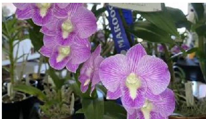
Dendrobium Salaya Stripe