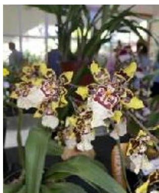
Oncidium intergeneric hybrid