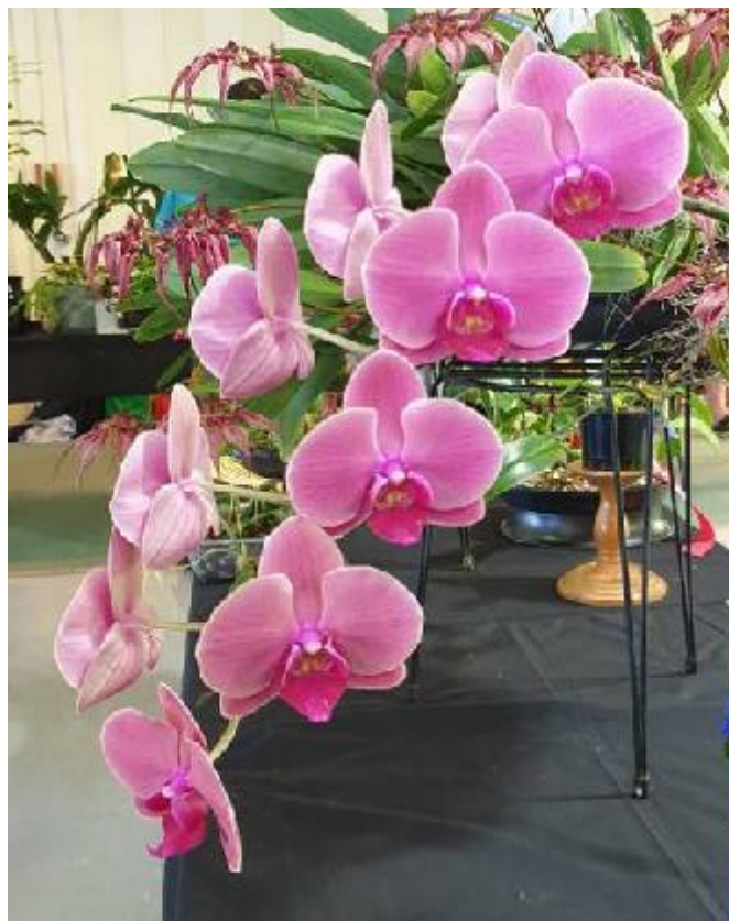
Phal Ox Golden Apple