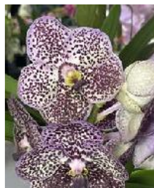
Vanda Kulwadee Fragrance