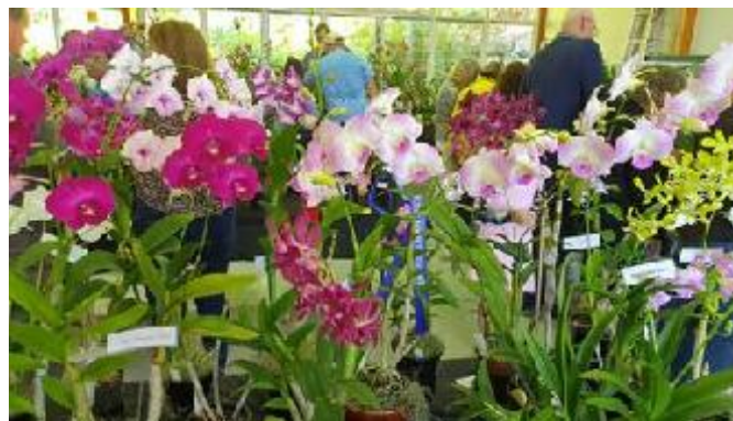
Phalaenanthe Dendrobium heaven