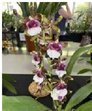
Oncidium Witch's Jewels