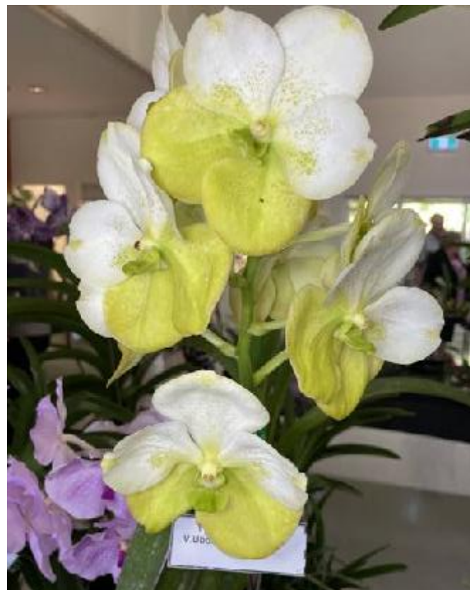
Vanda Ubon Gold