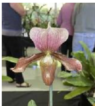
Paphiopedilum Hsinying Love x charlesworthii