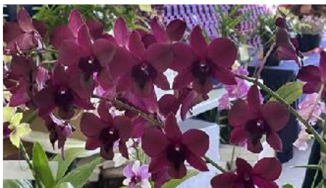
Dendrobium Airy Crimson