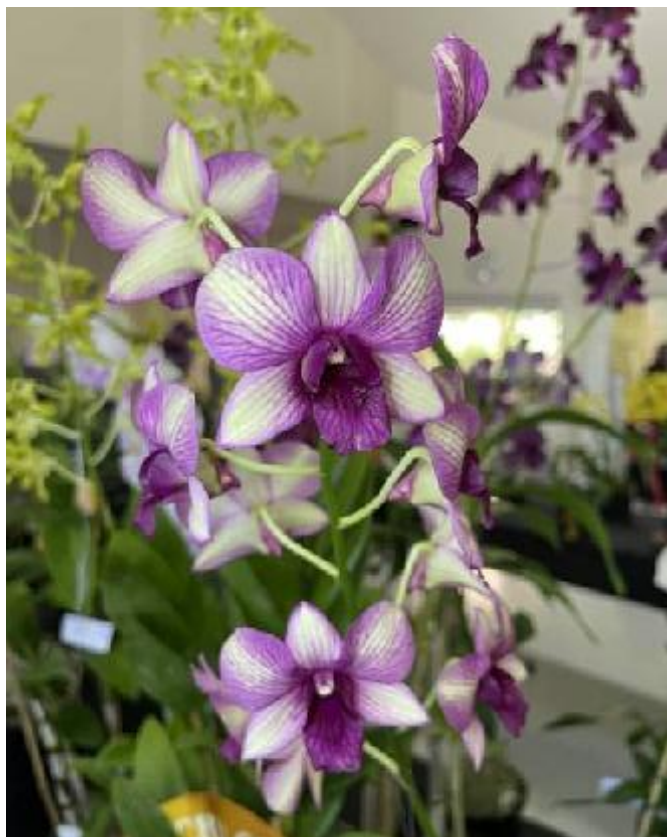
Phalaenanth-Spatulata Dendrobium hybrid