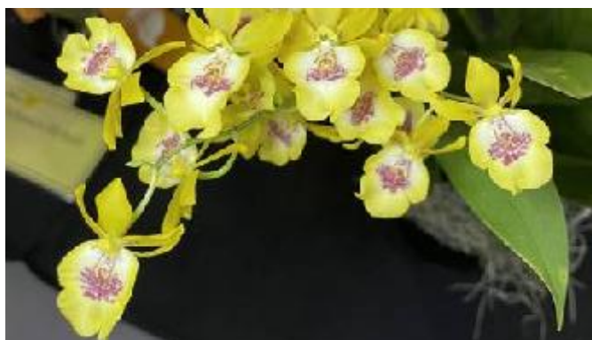
Oncidesa Hwuluduen Chameleon