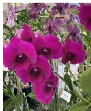
Dendrobium Dark Desire