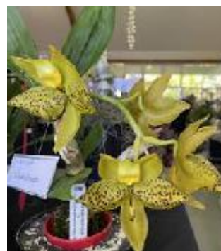
Cycnoches Dark Swan x Richard Brandon