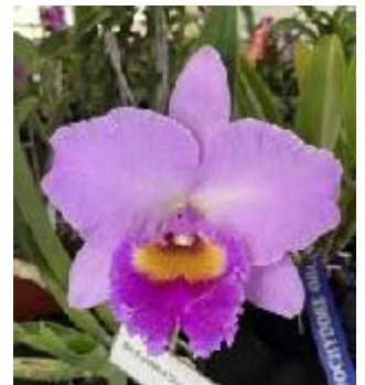
Rhyncholaeliocattleya Burdekin Dreamland