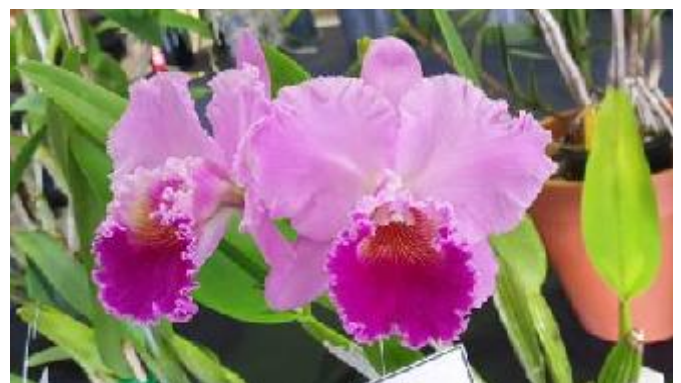
Rhyncholaeliocattleya Dal's Tribute