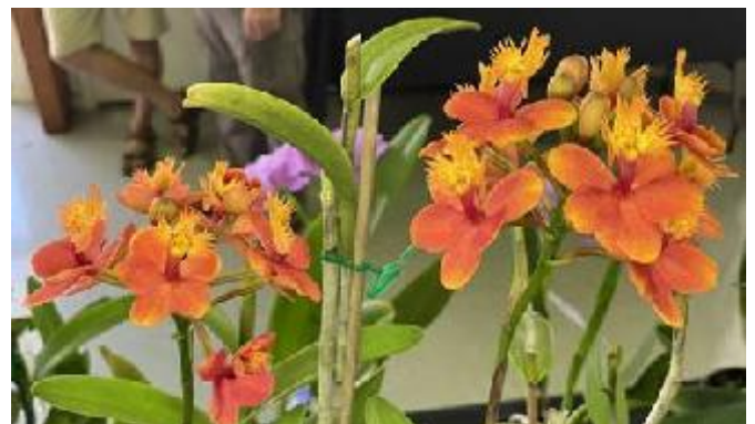
Reed-stem Epidendrum hybrid