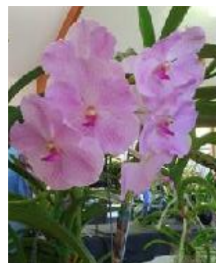
Vanda Kultana Pink Pearl