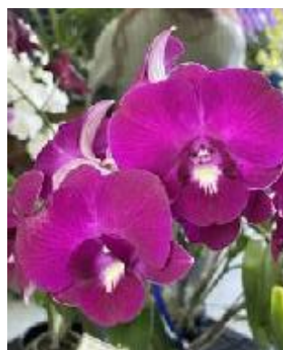
Dendrobium Flawless Pink