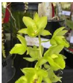
Fredclarkeara Turning Point x Catasetum De Etta Harris