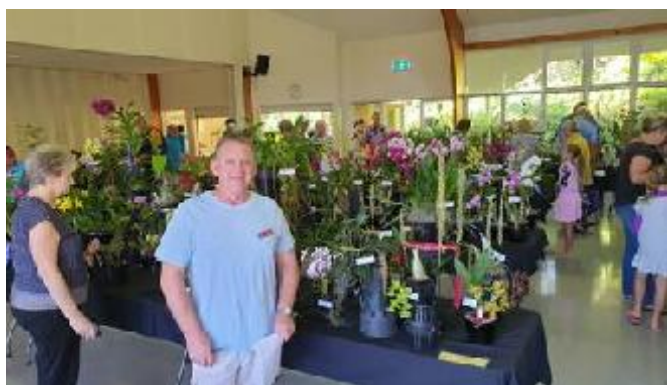
Barry is looking mighty proud