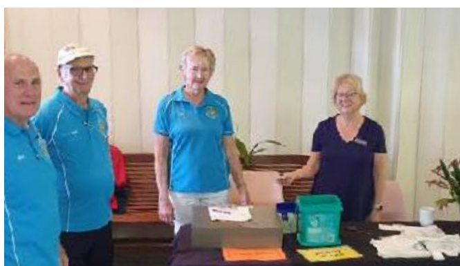
A well staffed sales table