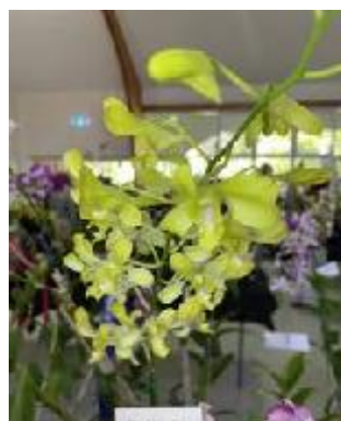
Dendrobium Yellow Twist