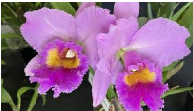
Exhibition Cattleya hybrid