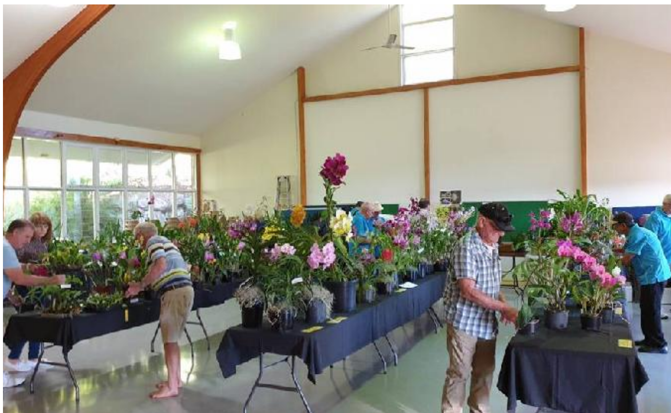
The crew putting the finishing touches on perfection