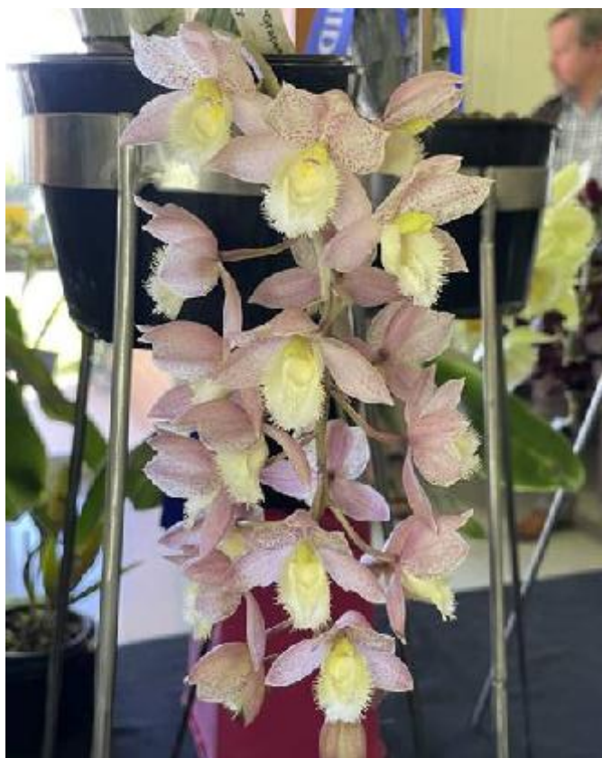
Cl. Rebecca Northen 'Grapefruit Pink' x Ctsm. tigrinum 'SVO'