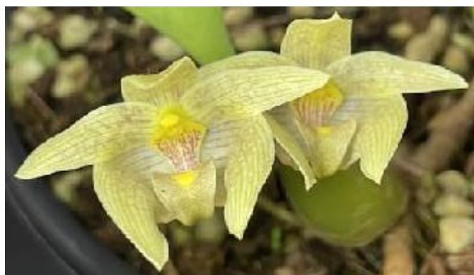
Bulbophyllum lobbii var. siamense