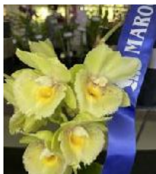
Intergeneric Catasetum hybrid