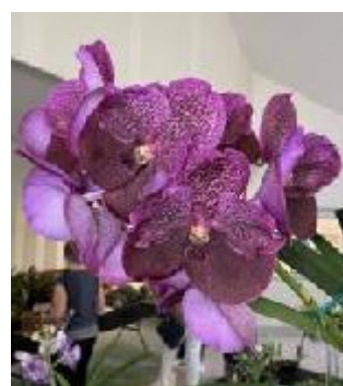
Vanda Memoria Kathleen McKartney x Blitz Hearthrob