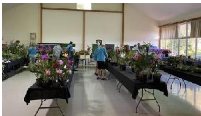
The tables are filling up