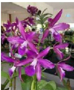
Novelty Cattleya hybrid