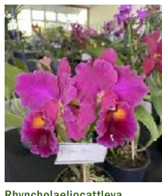
Rhyncholaeliocattleya Ubon Storm