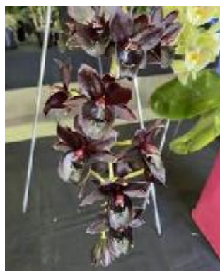
Fredclarkeara After Dark