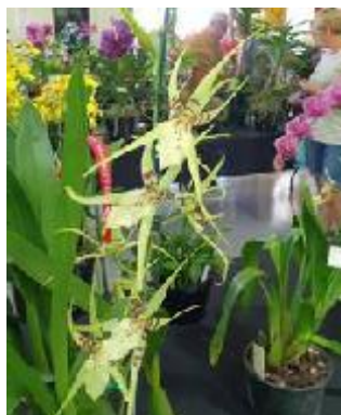
Bratonia Penny Micklow