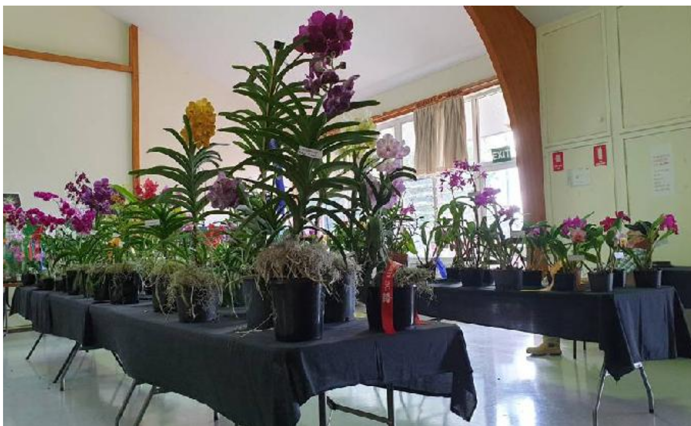
The calm before the storm