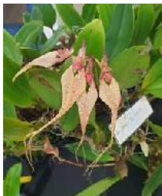
Bulbophyllum Wilmar Sunrise