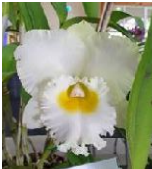
Rhyncholaeliocattleya Petch Sayam