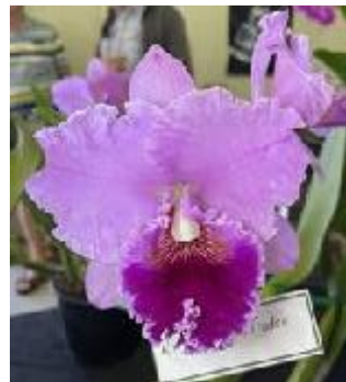
Rhyncholaeliocattleya Dream Trader