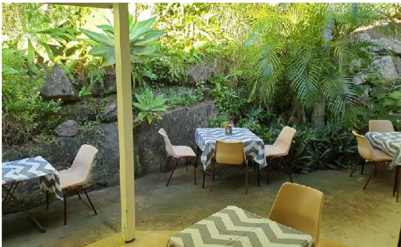
The cafe out the back