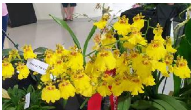
Oncidium Sweet Sugar