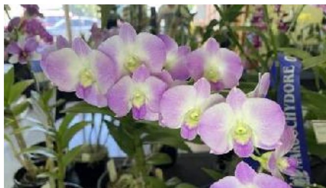
Phalaenanthe Dendrobium hybrid