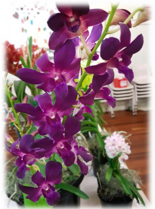
Den Airy Blue