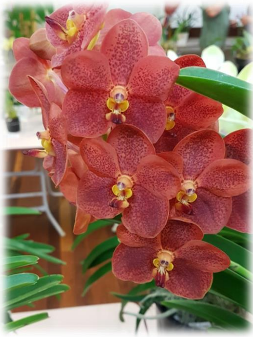
V. Fuchs Spotted Orange