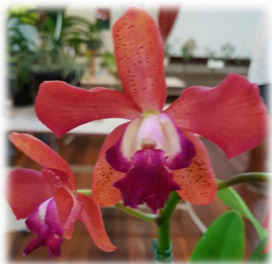
C. Precious Jewel x C. Caudebec