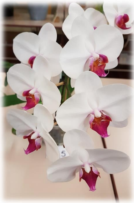
Phal. Bamboo Baby