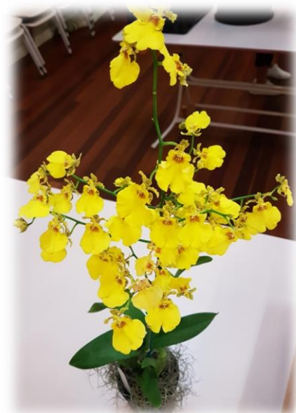
Onc.. Sweet Sugar