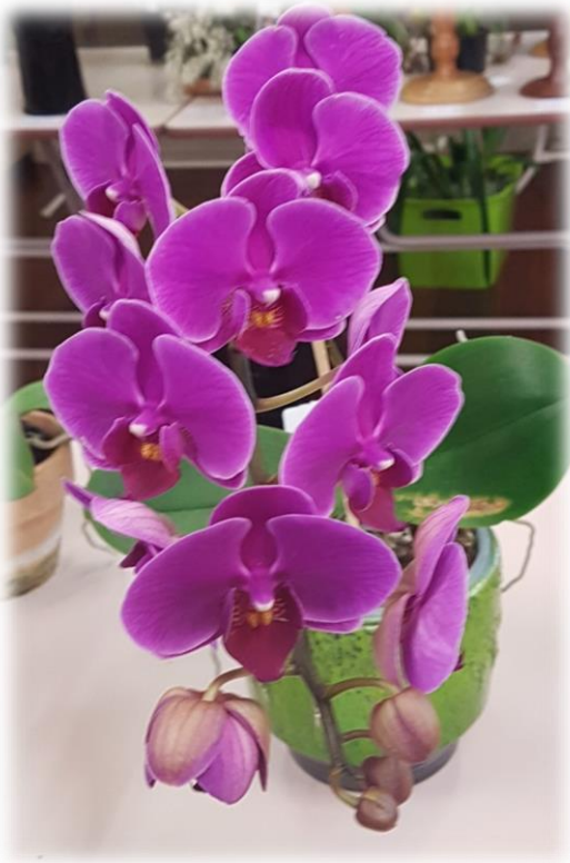
Phal. Surf Song