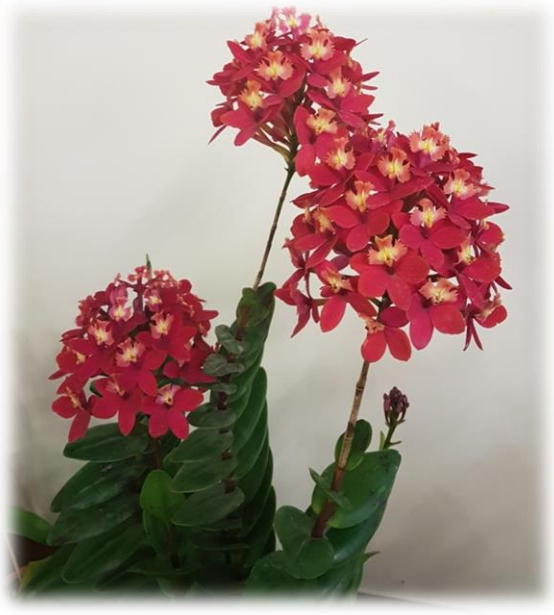
Epi. Max Valley

We purchased Paph. lowii from Darryl Banks last year. It is grown under cover and sits in a saucer of water. It is fertilized once a week. The plant is grown where there is a lot of air flow and light with humidity about 80 %. It is a vigorous growing plant that has large flowers and a good flower count. The flowers last for 2- 3 months.