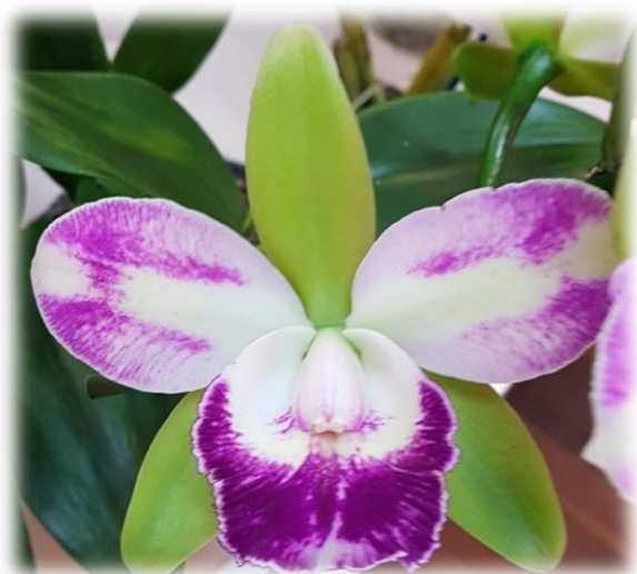
R/c. Village Chief North