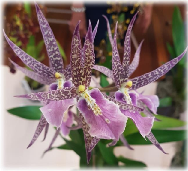
Milt. Charles Fitch