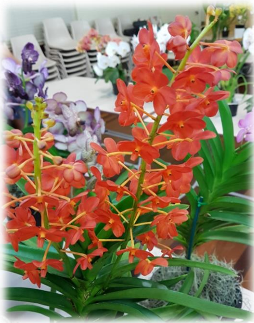
V. Bangyikhan Gold x V. miniata