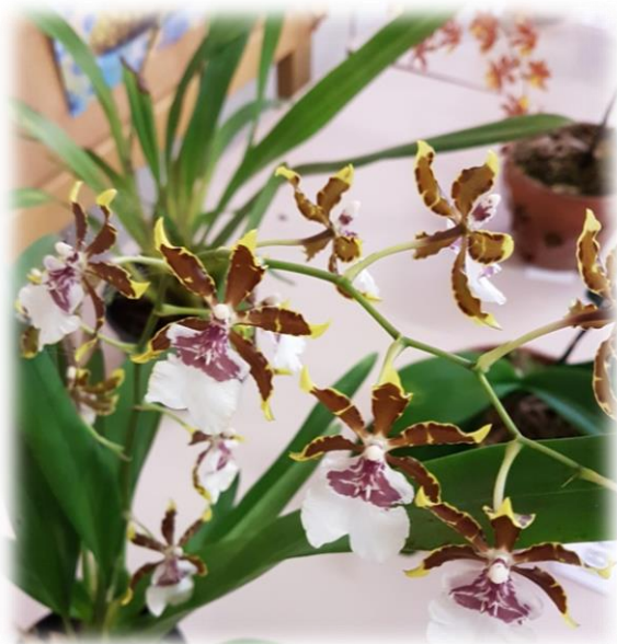
Onc Jungle Monarch