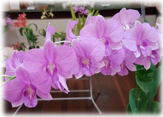
Den. Airy Big Pink