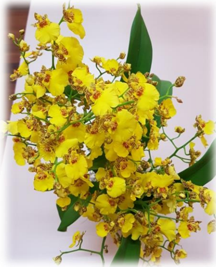
Onc. Sweet Sugar