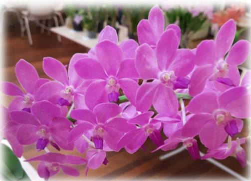
Aer. lawrencae x V. Captain Chor