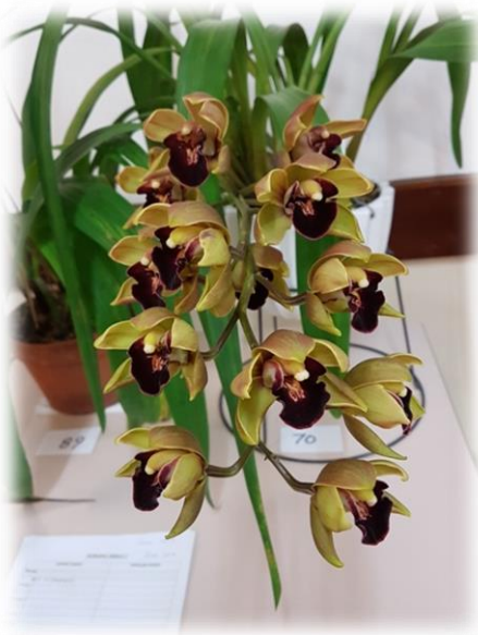
Spth. Gold Tower