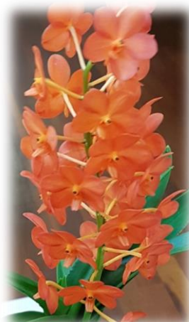
Aer. lawrencae x V. Captain Chor