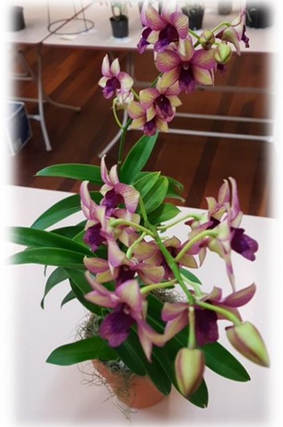
Den. Nippon Green Star