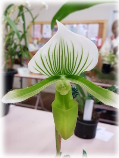
Paph. Hilo Citron