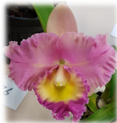
Rlc. Fort Launadale Show x Rlc. Dream Trader