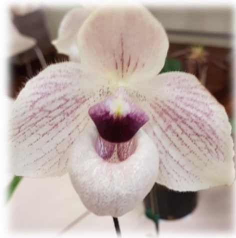
Paph. Lindly Kooperwuitz