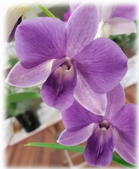
Den. Blue Planet