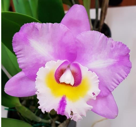
Rlc. Glenlee Treasure