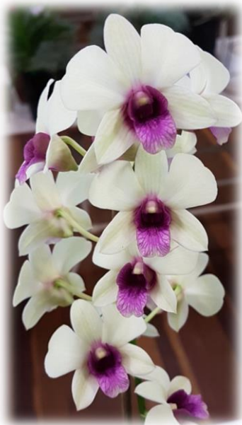
Den. Jade Classic