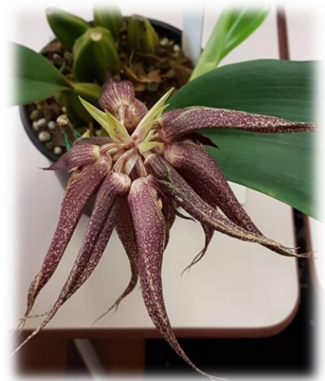
Bulb. phalaenopsis x Bulb. longissimum