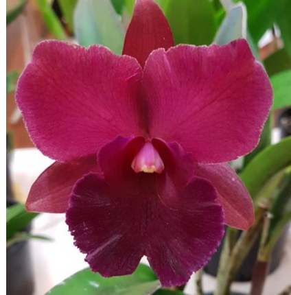
Lc. Mari's Surprise x Lc. Dal's Capri