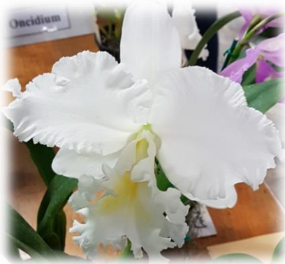
Rlc Burdekin Bells