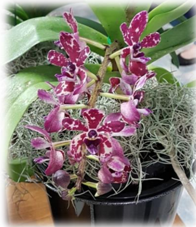
Ryphs Dixie Delight