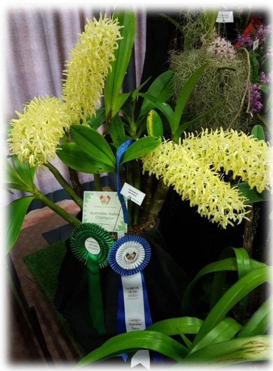
Champion Australian Native