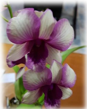
Den Golden Green