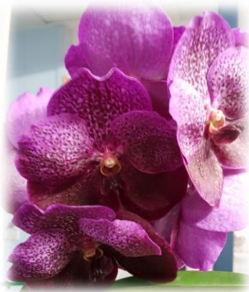
V. Catherine McCarthy x V. Bitz Heartthrob