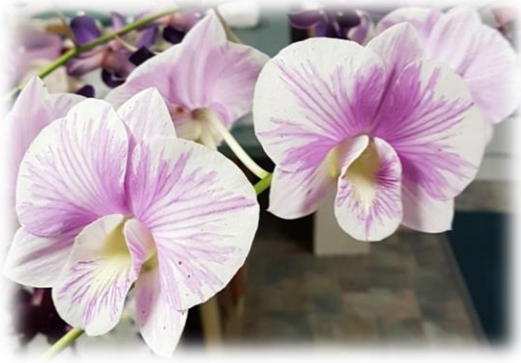
Den. Banyadt Pink