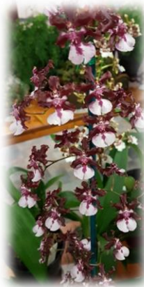
Onc. Sharry Baby