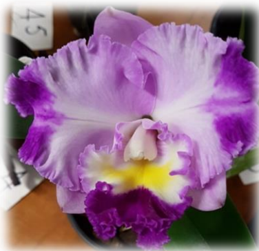
Rlc Burdekin Charm