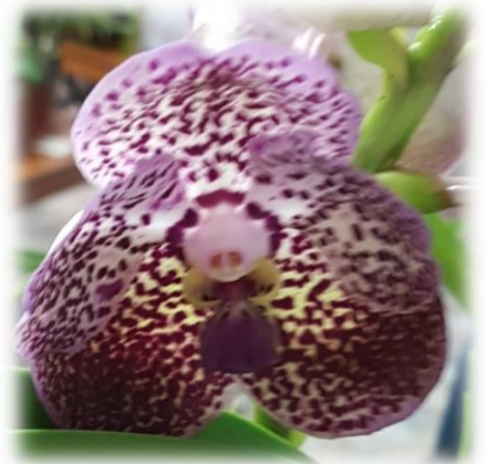
V. Kulwadee Fragrance