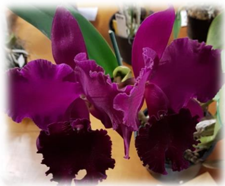
Rlc Burdekin Storm