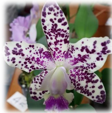
Rlc Wainanae Leopard