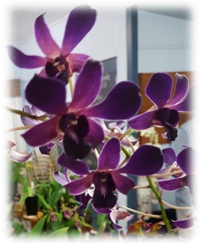
Den. Blue Foxtail