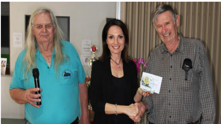
R Aisthorpe Reserve & Species Champions