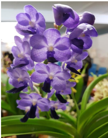
Vanda Thailand Blue