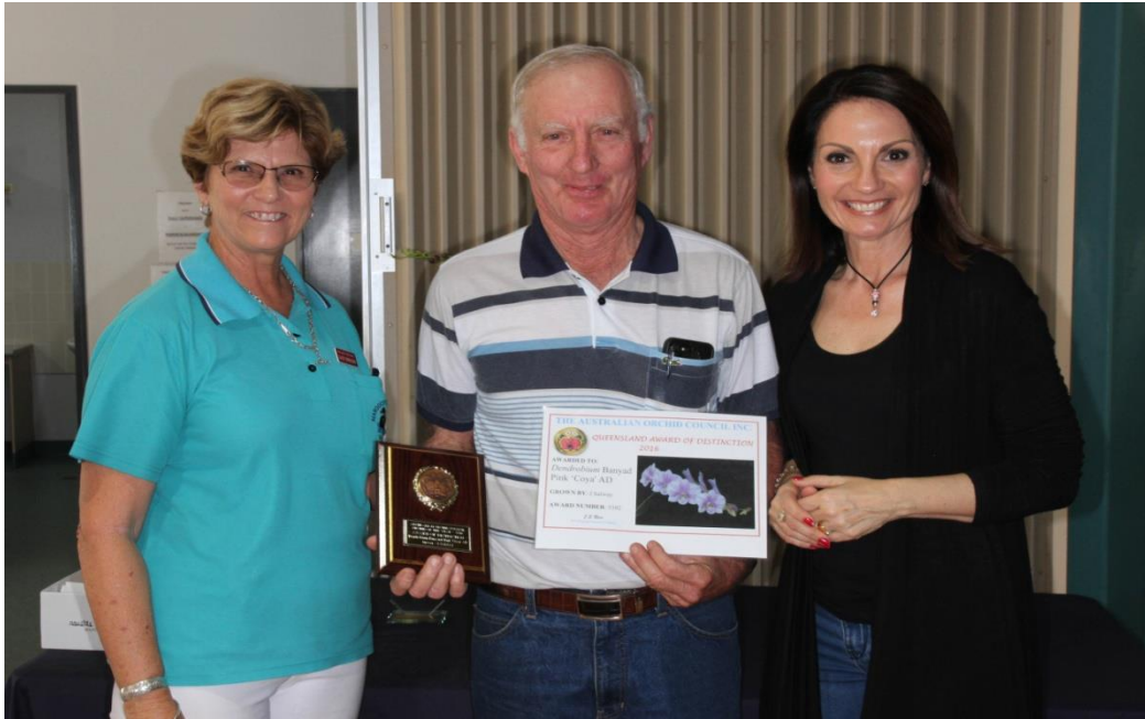
AOC Orchid of the Year & Award of Distinction & Qld Award of Distinction