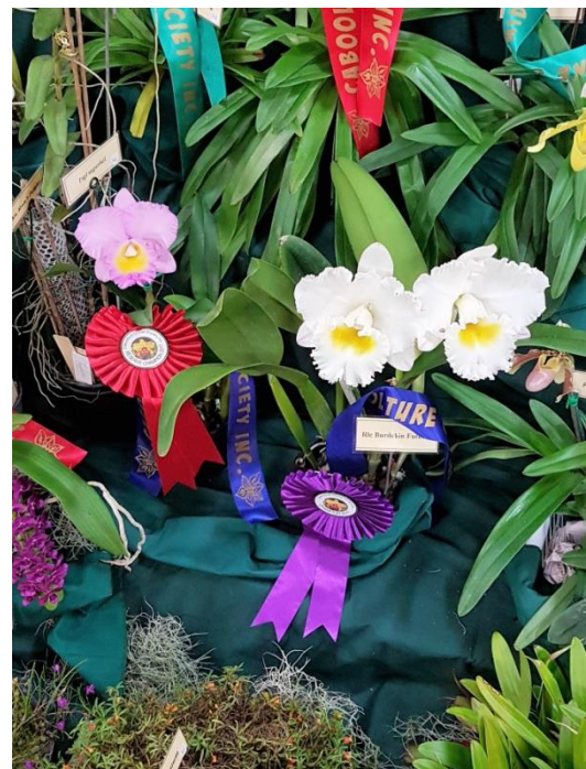
CHAMPION AND RESERVE CHAMPION