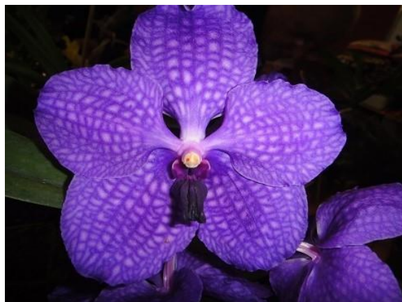
V PACHARA DELIGHT