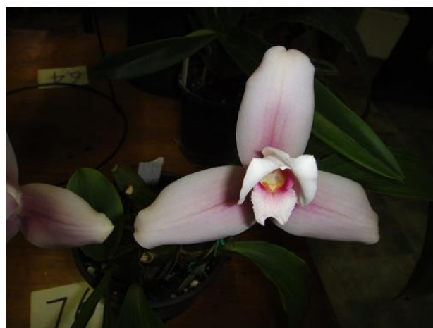
Lyc ATLANTIS X Lyc GYRA