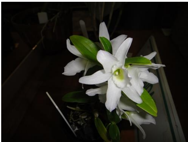
Den ANGEL BABY