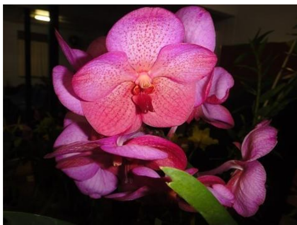
V KULTANA GEMS